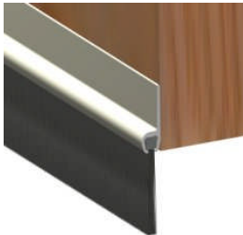
PVC BRUSH STRIP

Aluminium or Gold anodised finish in 914mm & 2100mm lengths